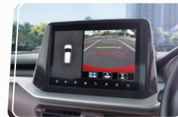
360 View Camera