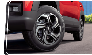
Bold Geometric Alloy Wheels

The Hot and Techy Brezza introduces a youthful and energetic design, ensuring you are ready for an adventurous drive in the city every day. Its commanding stance, impressive looks and precision detailing ensure that it never goes unnoticed. The City-Bred SUV comes with a clean Beltline with Bold Geometric Alloy Wheels, Dual Tone exteriors with a Shark Fin Antenna that enhances its design.