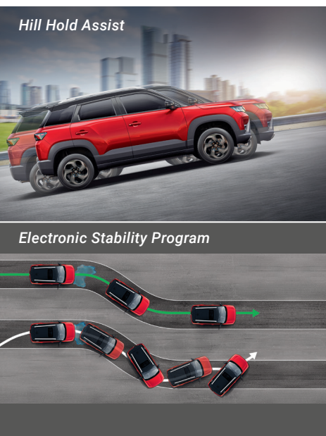
Hill Hold Assist