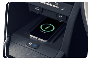
Wireless Charging Dock

The Hot and Techy Brezza carries a youthful and exciting appeal on the inside with your convenience at its core. It gets a unique design, modern and sleek look and black and brown interiors with silver accents for a sporty and urban feel. The City-Bred SUV also has Rear AC Vents, a Fast Charging USB Port (Type A and C) and a flat bottom Steering Wheel for your enhanced comfort and convenience. The 6-Speed Automatic Transmission with Paddle Shifters and Telescopic Steering ensure you go on city adventures comfortably.