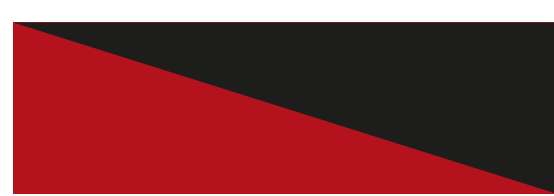
Sizzling Red with Midnight Black Roof

Google™ services like Google Map™ and Google Search™. Get the Android Auto app on Google Play™. Android Auto is available in the countries listed at the following link: https://www.android.com/auto/#hit-the-road . Most phones with Android 5.0+ work with Android Auto: https://support.google.com/androidauto/#6140477 . Android, Android Auto, Google, Google Play and other marks are trademarks of Google Inc. *Some parts of the leather appointed upholstery will contain man-made material. **For details on functioning of safety features including air bag, kindly refer to the Owners Manual. #Available only in ZXi/ZXi+ variants as a Limited edition, till the stock lasts.