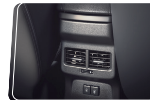
Rear AC Vents with Fast Charging USB Ports