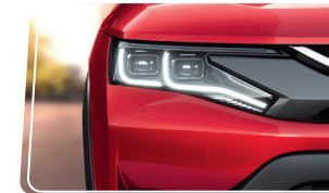
Dual LED Projector Headlamps with LED DRLs