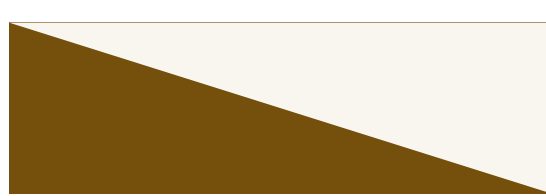
Brave Khakhi with Arctic White Roof