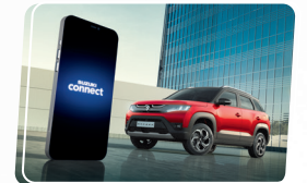
Next Gen Suzuki Connect