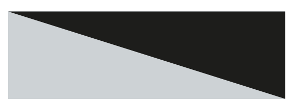
Splendid Silver with Midnight Black Roof