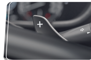
6-Speed AT with Paddle Shifters