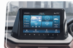
SmartPlay Pro+ with Surround Sense powered by ARKAMYS