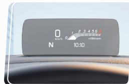
Head Up Display